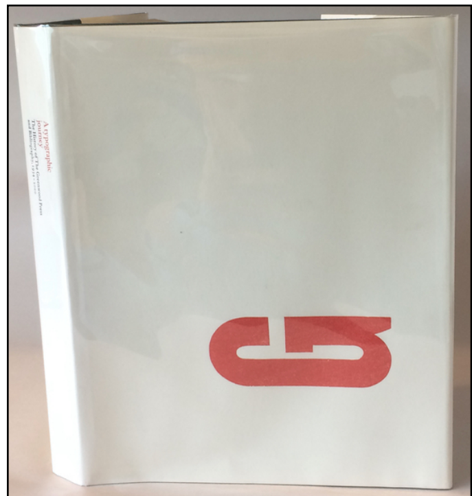
Item # 17: A Typographic Journey