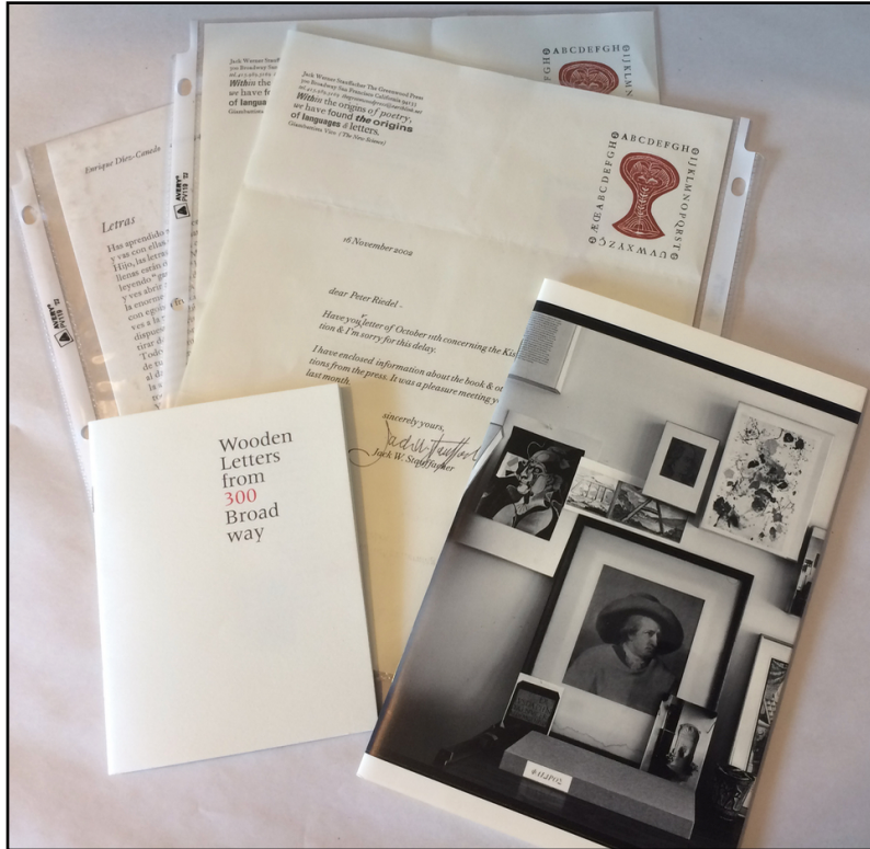
Item # 15: 6 Greenwood Press Items